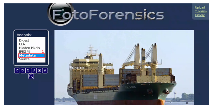
FotoForensics, post image upload with metadata selected.