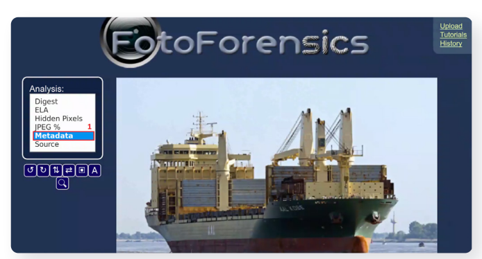
Figure 3 | FotoForensics post image upload with metadata analysis selected