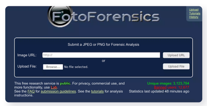
Figure 2 | FotoForensics user interface